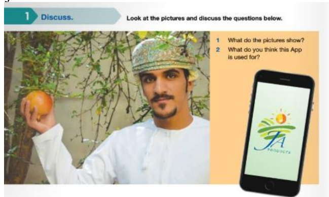
Figure 5: Unit Four – English for Me 10B

Textbooks also represent how traditions change in modern times, such as depicting a smartphone app that promotes local food alongside traditional garb. This demonstrates an understanding of cultural dynamism, informing pupils that cultural practices do not remain static but fluctuate in response to technology and societal changes. Such depiction helps students manage the junction between tradition and innovation in a worldwide society.