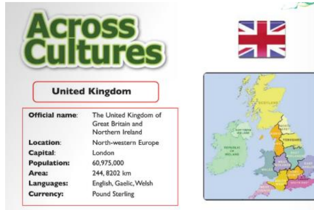
Figure 2: Unite Five- Engage with English 11A Balance of Local Traditions and Global Awareness

There is a concerted effort to expose pupils to elements of both target cultures (e.g., UK, US) and international cultures (e.g., Brazil, China, Canada). Table tennis, examining UK geography, and learning about Brazilian festivities all help pupils extend their cultural horizons. This exposure promotes intercultural competency by training students to engage with global societies outside their immediate context.