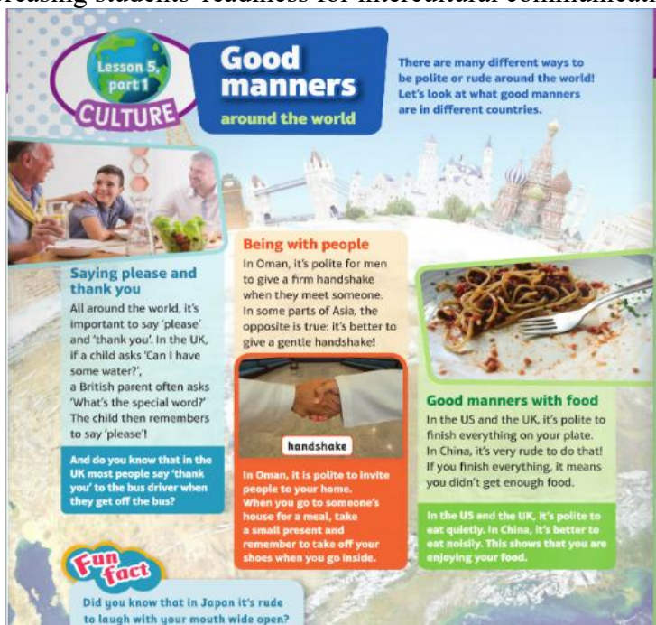
Figure 1: Unit One -Team Together Oman 5A Modeling Cultural Evolution in a Modern Setting

Students learn to appreciate behavioral differences and acquire cultural sensitivity by contrasting cultural behaviors such as dining manners in China with those in the UK/US. These contrasts not only expose cultural diversity, but also foster critical thinking about social norms and behaviors, increasing students' readiness for intercultural communication.