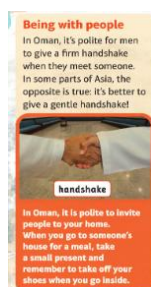
Figure 1: Unite One – Team Together Oman 5A

The textbooks provide a strong emphasis on Source Culture, with graphics and prose depicting traditional Omani garb, national rituals such as handshakes, and significant historical landmarks. This continuous depiction instills a strong sense of cultural identification and pride in students, sustaining their connection to their local heritage while studying English. Such content reinforces national identification by incorporating cultural values into daily language learning exercises.